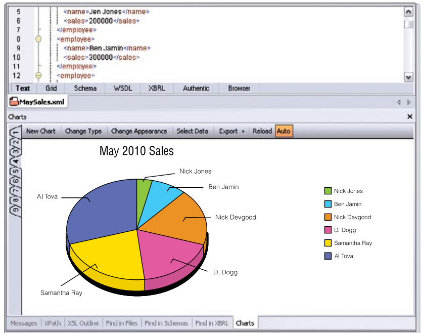
Chart creation from XML data